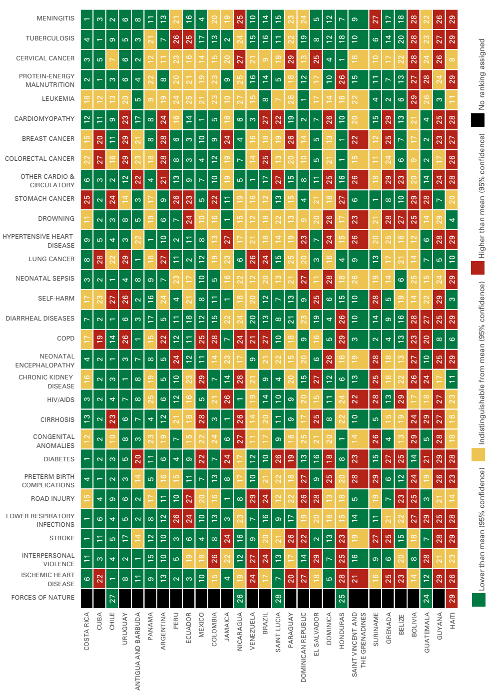
Note: The columns are ordered by the absolute number of YLLs for that particular year. The numbers indicate the rank across countries for each cause in terms of age-standardized YLL rates, with 1 as the best performance and 29 as the worst.